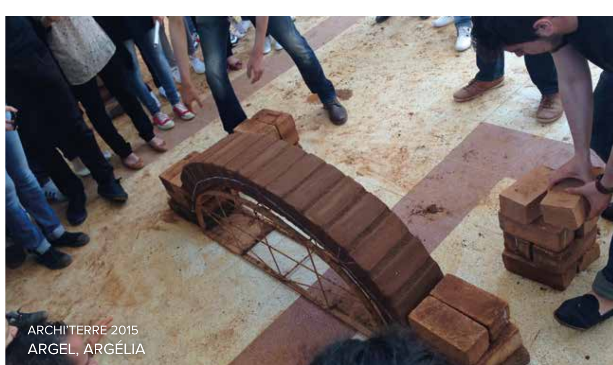
ARCHI'TERRE 2015 ARGEL, ARGELIA