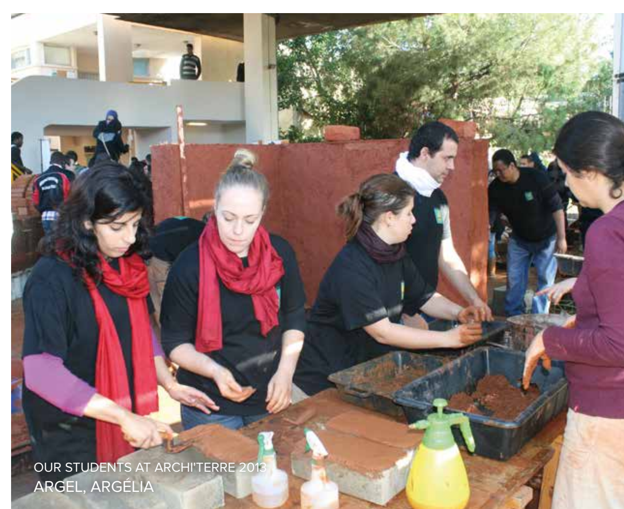
OUR STUDENTS AT ARCHI'TERRE 2013 ARGEL, ARGELIA