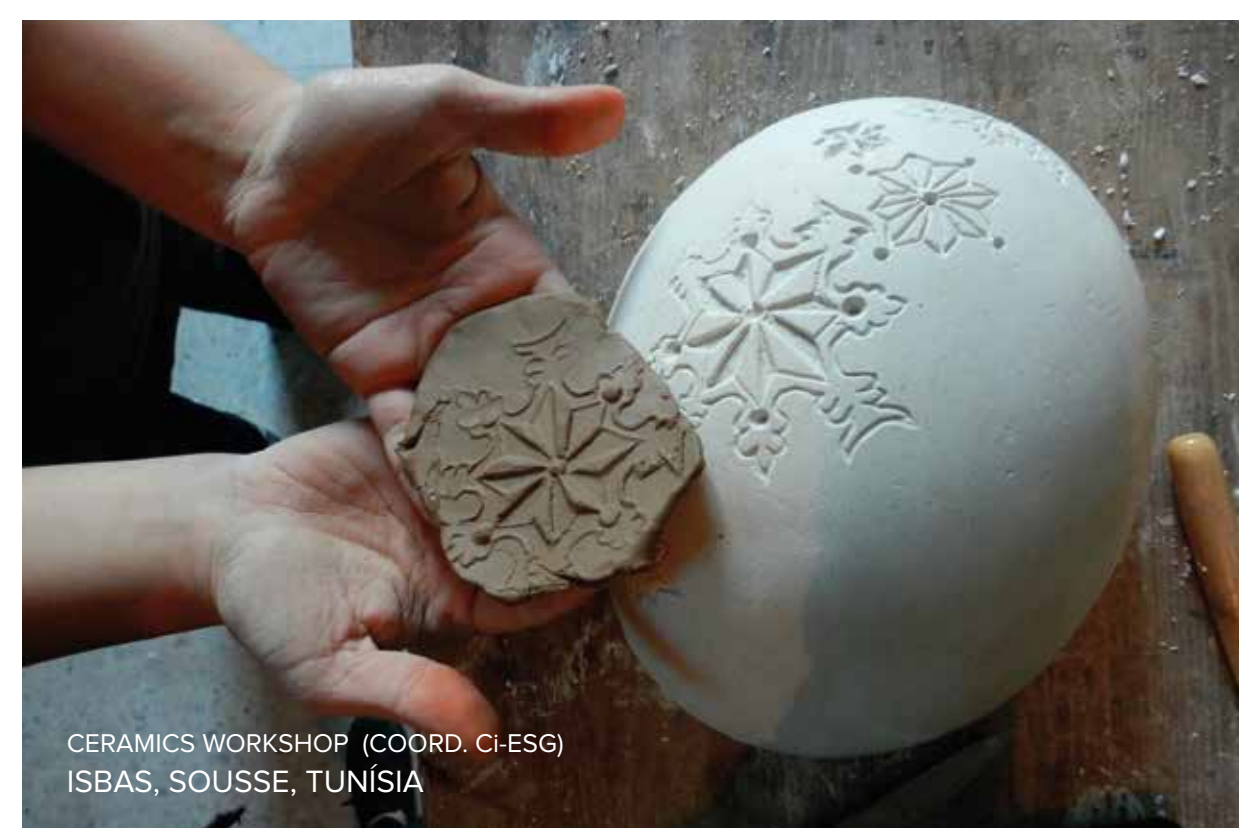
CERAMICS WORKSHOP (COORD. CIESG) ISBAS, SOUSSE, TUNISIA