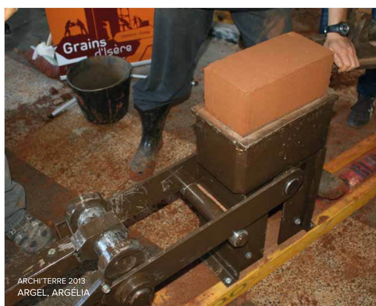
ARCHI'TERRE 2013 ARGEL, ARGELIA

The International Festival of Earthen Architecture was annually organized by the Ministry of Culture of Algeria (2010 to 2018) with the objective of raising national and international awareness for earthen architectural heritage conservation, for the preservation of the Algerian earthen Kasbahs and the intangible knowledge and traditional know-how associated with their safeguard. Each year, our research team was invited to teach in seminars and workshops, to international and Algerian students (coming from 20 universities around the country), and our students would be invited to participate in the workshops.