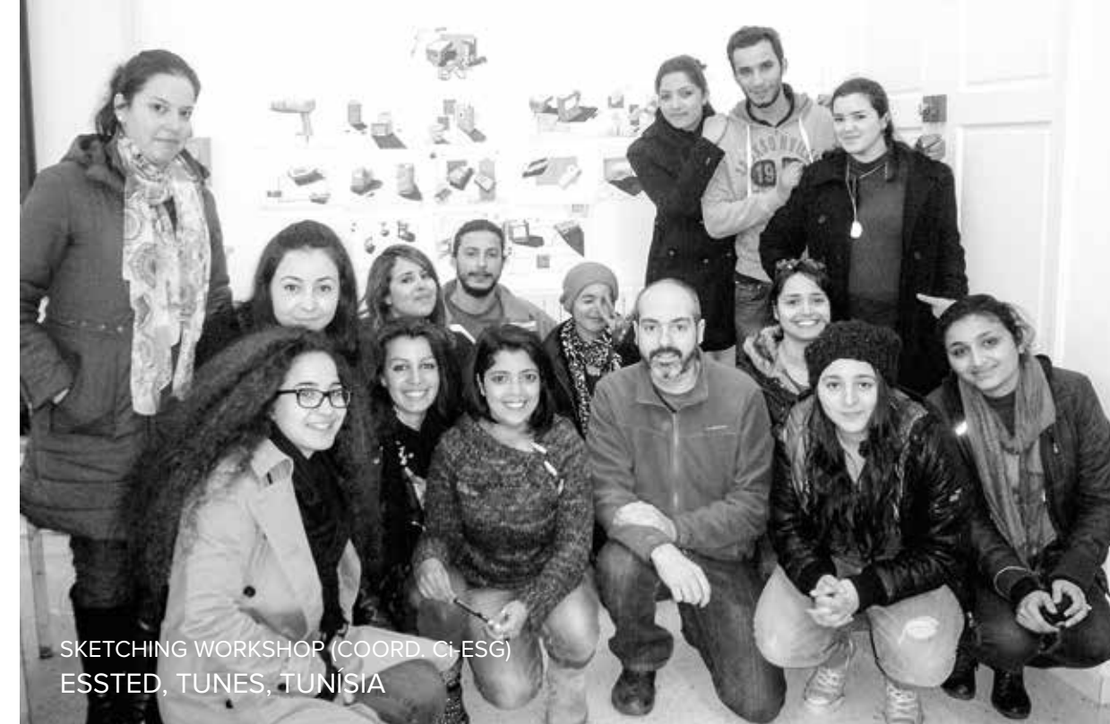
SKETCHING WORKSHOPS ESSTED, TUNES, TUNISIA