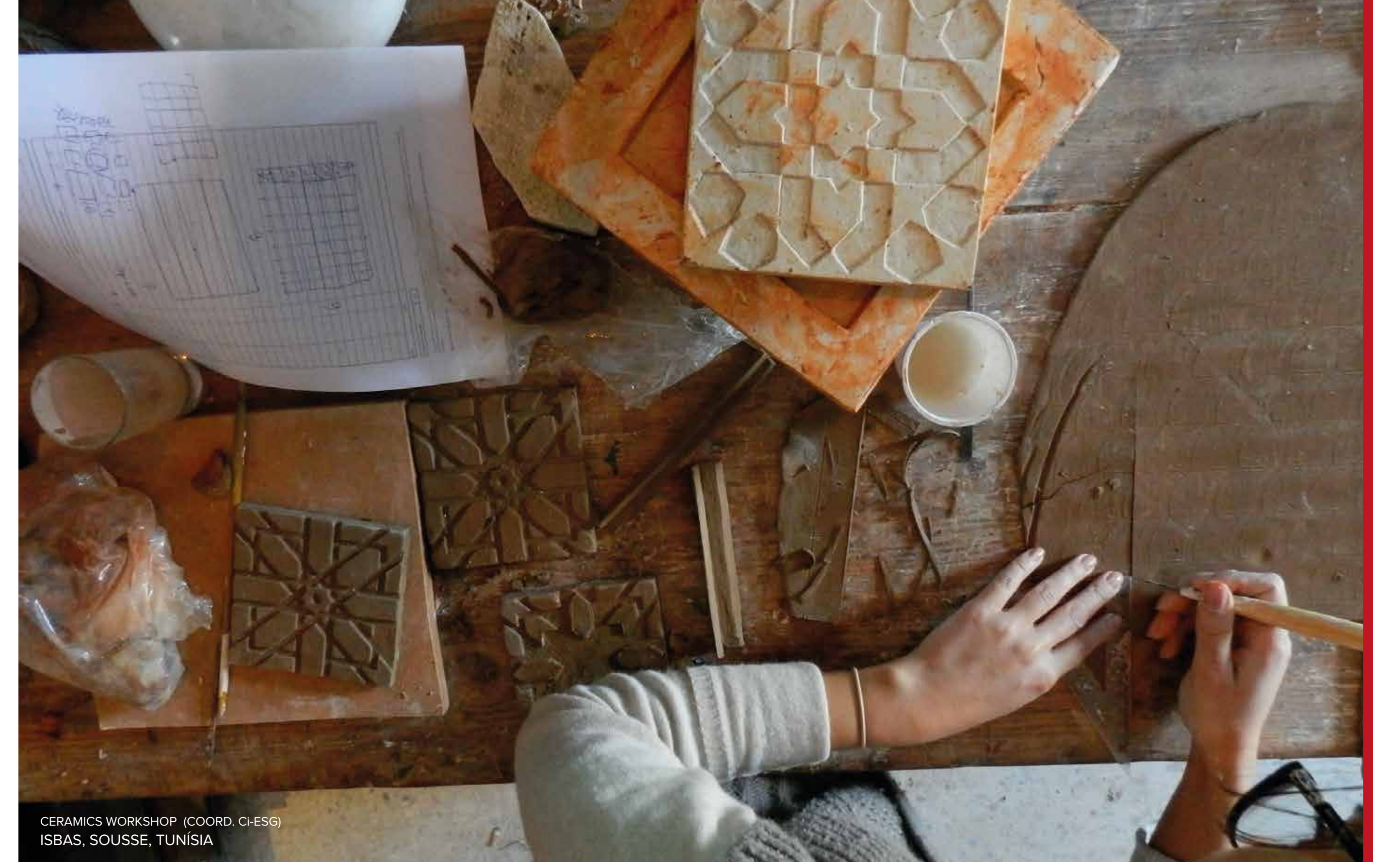
CERAMICS WORKSHOP (COORD. CIESG) ISBAS, SOUSSE, TUNISIA