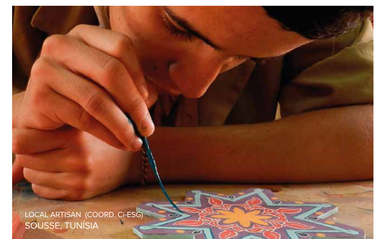
LOCAL ARTISAN (COORD. CIESG) SOUSSE, TUNISIA

INTERNATIONAL COOPERATION EARTHEN ARCHITECTURE