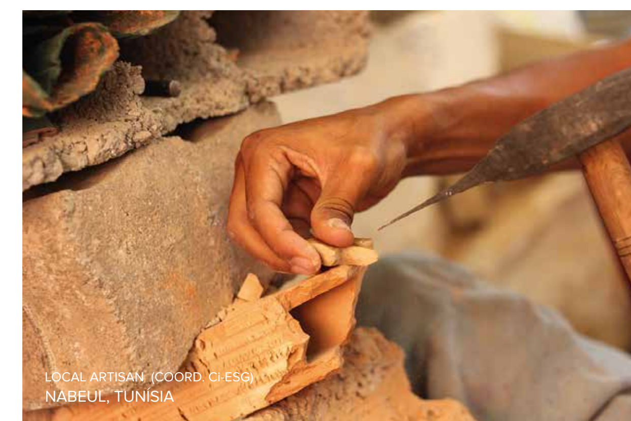
LOCAL ARTISAN (COORD. CIESG) NABEUL, TUNISIA