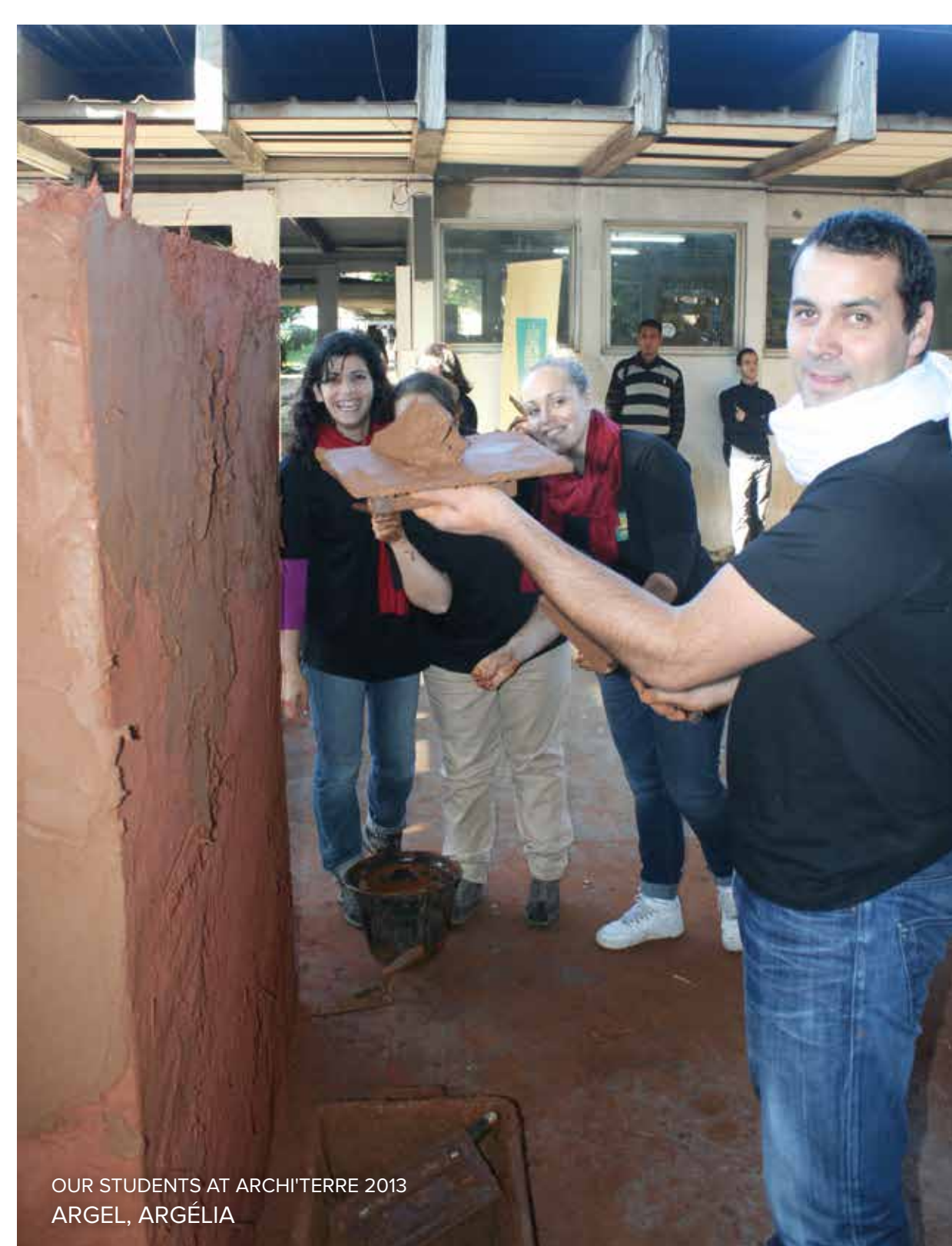
OUR STUDENTS AT ARCHI'TERRE 2013 ARGEL, ARGELIA