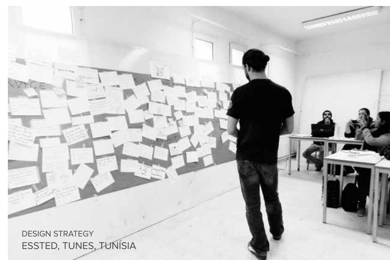
DESIGN STRATEGY ESSTED, TUNES, TUNISIA