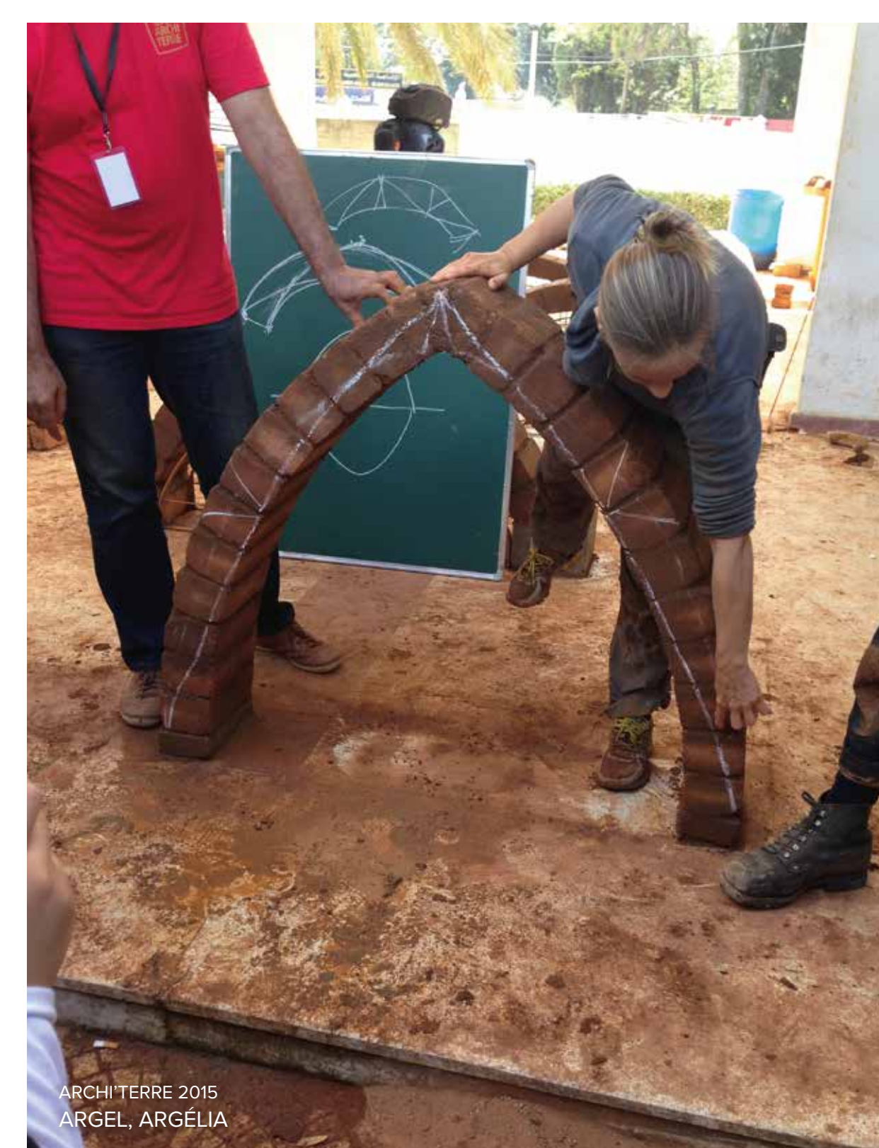
ARCHI'TERRE 2015 ARGEL, ARGELIA