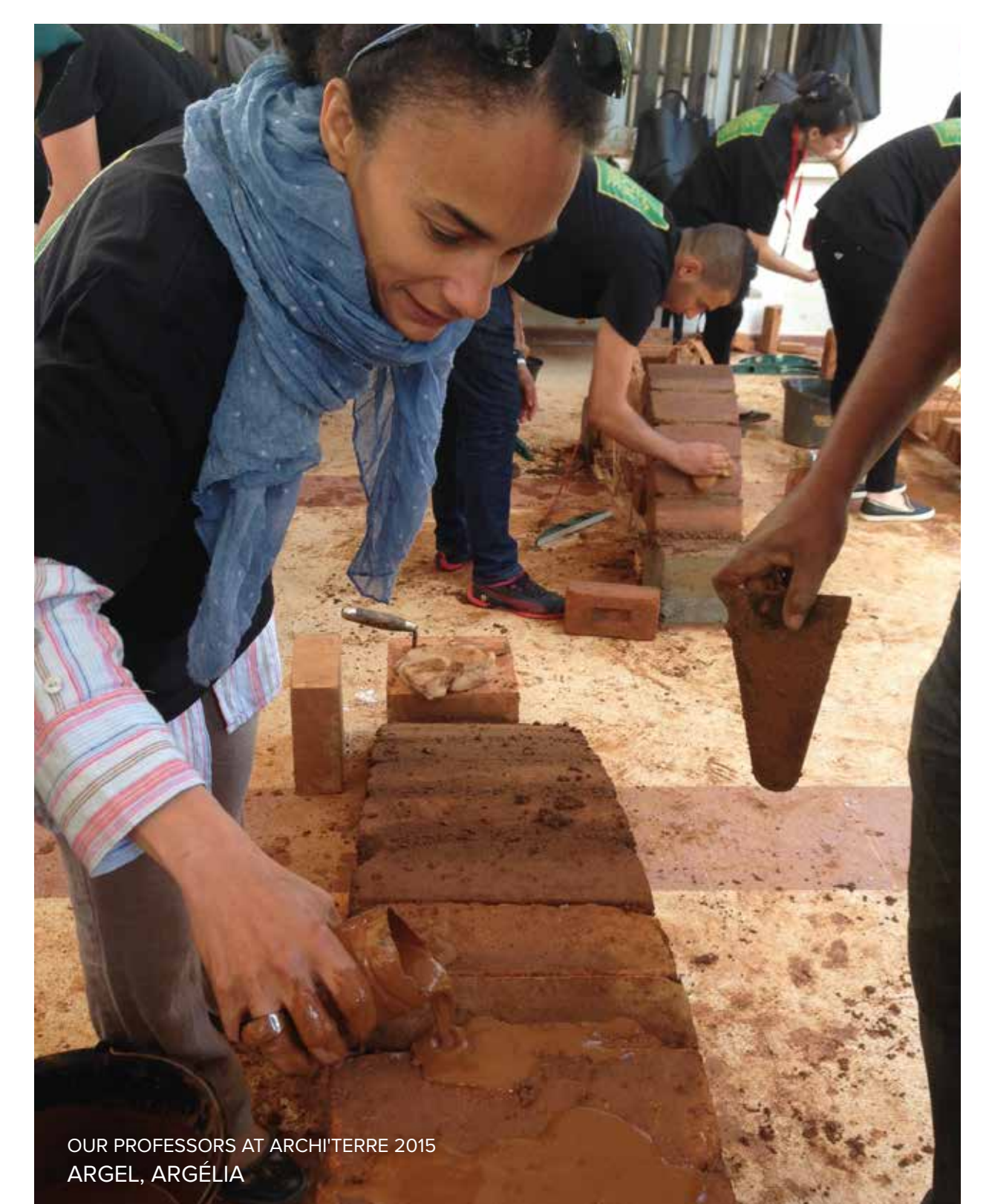
OUR PROFESSORS AT ARCHI'TERRE 2015 ARGEL, ARGELIA